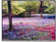
Bluebell - Hyacinthoides non-scripta

The following list is a selection of some commonly available native plants. Please select plants by their Latin botanical name wherever possible to ensure accuracy.