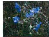
Meadow Crane's Bill - Geranium pratense