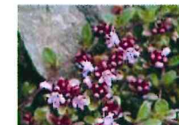
Wild Thyme - Thymus polytrichus