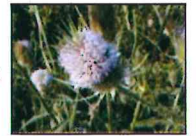
Teasel - Dipsacus fullonum