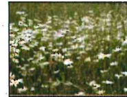
Ox-eye daisy - Leucanthermum vulgare