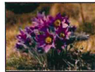
Pasque flower - Pulsatilla vulgaris