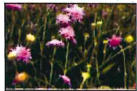
Field Scabious - Knautia arvensis