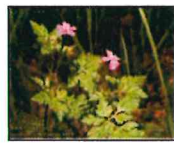
Herb-Robert - Geranium robertianum