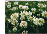
White clover - Trifolium repens