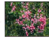
Red campion - Silene dioica