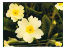
Primrose - Primula vulgaris