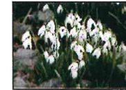
Snowdrop - Galanthus nivalis