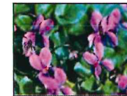
Sweet violet - Viola odorata