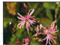
Ragged -Robin - Lychnis flos-cuculi