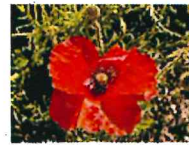
Field poppy - papaver rhoeas