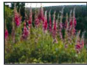
Foxglove - Digitalis purpurea