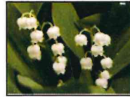
Lily of the Valley - Convallaria majalis