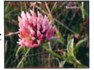
Red clover - Trifolium pratense