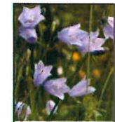
Harebell - Campanula rotundifolia